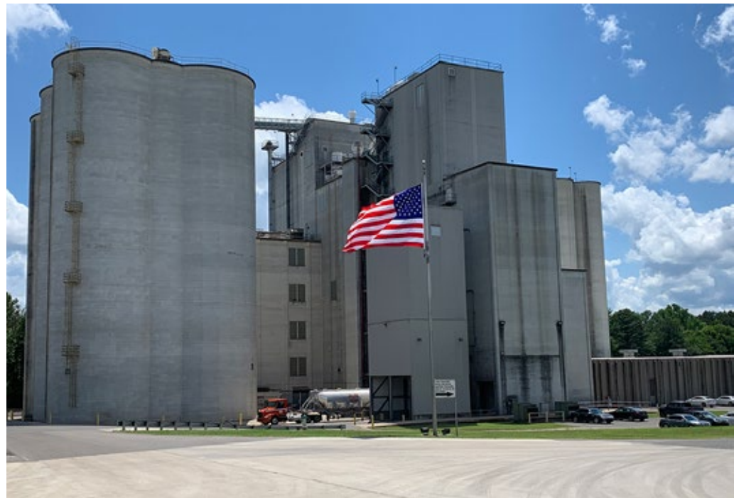
Grain Craft's Birmingham, Alabama mill.

logistical challenges such as transporting inbound raw materials and outbound finished flour to customers continue to be a concern. Finally, millers must always find the balance between grain yield and protein content and baking quality to ensure that the quality of the crop is maintained to meet consumer needs.