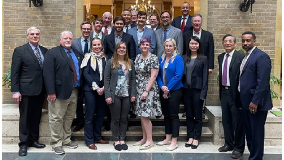
Members of the National Wheat Improvement Committee visited Capitol Hill in March to lobby for wheat research.

In addition to expressing our concern about the proposed cuts to the USWBSI and SGGI, the NWIC asked for an additional $750,000 in funding for the National Stripe Rust Initiative. These new monies will be used to shore up the funding for the regional stripe rust screening nurseries. Finally, the NWIC reiterated the need for new monies to address the changing dynamics of pest and disease issues in wheat. For example, Wheat Stem Sawfly (WSS) is now causing an estimated $350 million in damages annually. Eastern Colorado and western