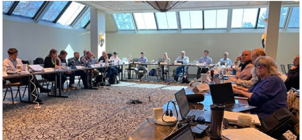
The USWBSI Steering Committee heard key reports, and spent time brainstorming and updating the Action Plan during their recent meeting in Minnesota.

The USWBSI Steering Committee Spring Meeting was held in person April 14, 2023. A core component of this year's meeting was the opportunity for the Research Area and Coordinated Project Chairs to report on progress from the last two years and identify unmet needs, which helped inform the stakeholder breakout sessions that reviewed and recommended updates to the Initiative Action Plan. The Action Plan serves as the guiding tool for the Initiative to align USWBSI priorities on the latest research on Fusarium Head Blight (scab) and deoxynivalenol (DON). Feedback will now go out to the Committees for review, with an updated Action Plan to be published in May. Additional discussions took place on the process for setting of the USWBSI Working Caps for the FY24 RFP, a potential Code of Conduct addition to the USWBSI Policies and Procedures, highlights on recent outcomes of the Communications Plan, and an update on plans for the 2023 and future National FHB Forums. The Steering Committee