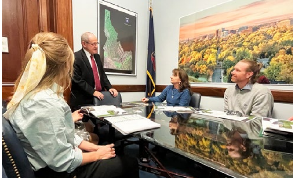
Members of the National Barley Improvement Committee visit with Senator Risch during their Hill visit on March 6-8, 2023.

"There was great energy in D.C., both from our NBIC members and throughout