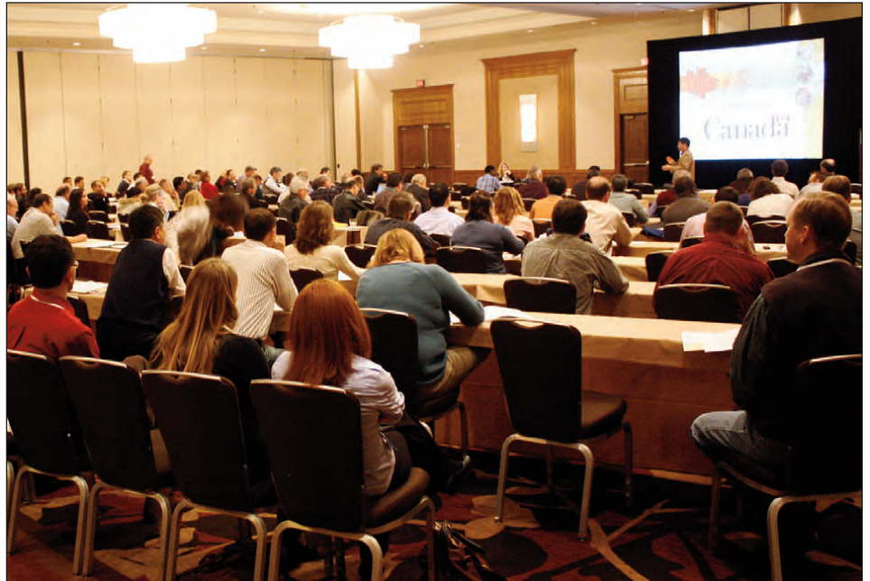
Above: Attendees at the 2011 FHB Forum represented a variety of scientific disciplines and commercial entities — from USDA and university research and extension personnel, to grain growers and agribusiness.

The following pages contain photos and narrative of excerpted highlights from the 2011 Forum. Full Forum proceedings are on USWBSI's website: www.scabusa.org . ❖