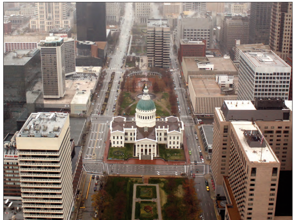
Below: With the Gateway Arch just across the street from the Forum hotel, some attendees took time for a ride to the top of the Arch. Skies were overcast, but the downtown view was still impressive.