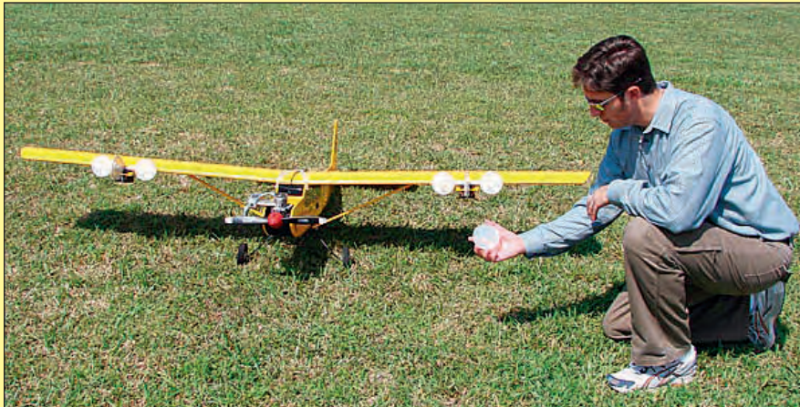
An autonomous unmanned aerial vehicle (UAV) used to collect viable spores of Gibberella zeae tens to hundreds of meters above agricultural fields. The UAV has spore-sampling devices mounted underneath the wings that are opened and closed by remote control from the ground once the UAV is aloft.

At VPI & SU, a new generation of autonomous (self-controlling) unmanned aerial vehicles (UAVs) are being used to determine the relative contribution of clonal inoculum sources of G. zeae to regional atmospheric populations of the pathogen and to forecast the movement of G. zeae across broad geographical regions. Autonomous UAVs have the potential to extend the range of atmospheric sampling, improve positional accuracy of sampling paths, and enable coordinated flight with multiple aircraft at different altitudes. These autonomous UAVs have been used to collect viable spores of G. zeae 100m above agricultural fields during fall and winter months, expanding the temporal range of spore transport for this important plant pathogen. ◆