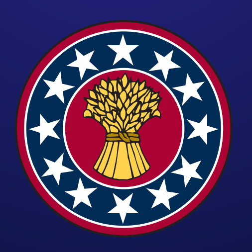
U.S. Wheat & Barley Scab Initiative