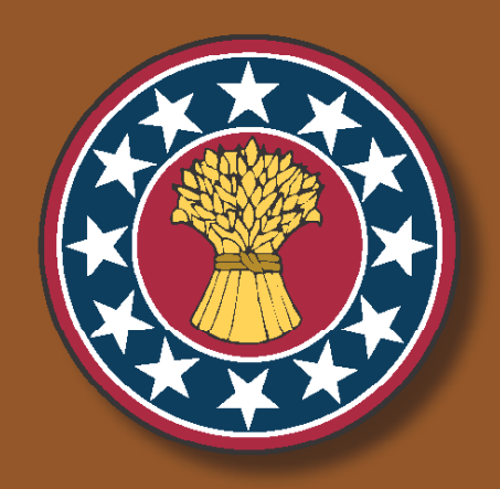
U.S. Wheat & Barley Scab Initiative