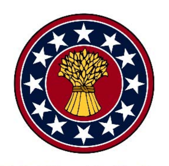
U.S. Wheat & Barley Scab Initiative