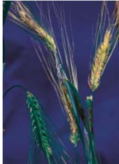
Lighter, discolored barley heads are infected with Fusarium head scab fungi.

The study points out that DON (Deoxynivalenol), the contaminant produced by FHB that can make barley unsuitable for malting and wheat unsuitable for milling, results in risks to participants throughout the marketing system including producers, end-users, and marketers, altering procurement and